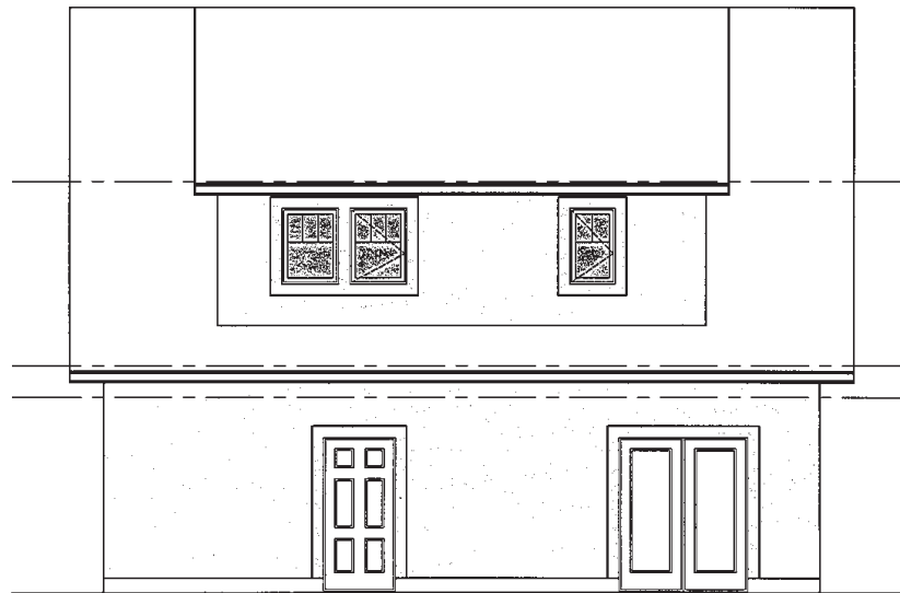
WEST ELEVATION SCALE: 3/16" = 1'-0"

ROBINSON RESIDENTIAL PERSONALIZING HOME DESIGN