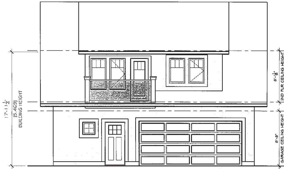
EAST ELEVATION SCALE: 3/16" = 1'-0"